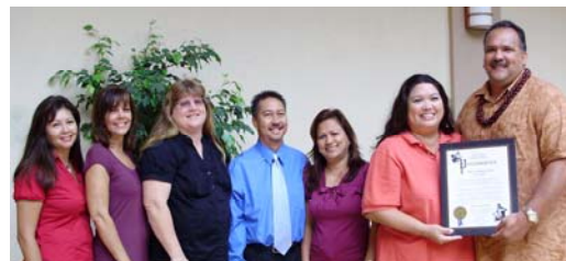
Kaua'i community representatives accept a mayoral proclamation celebrating May as National Foster Care Month